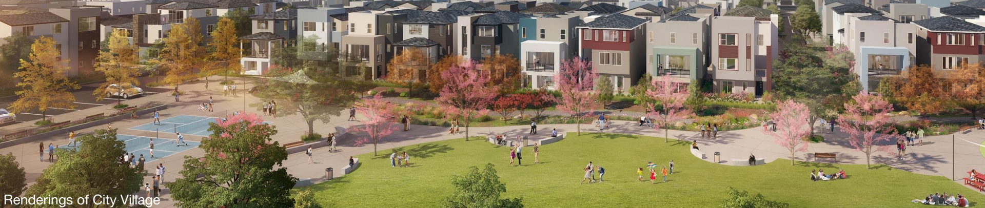
Renderings of City Village