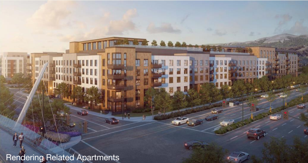
Rendering Related Apartments