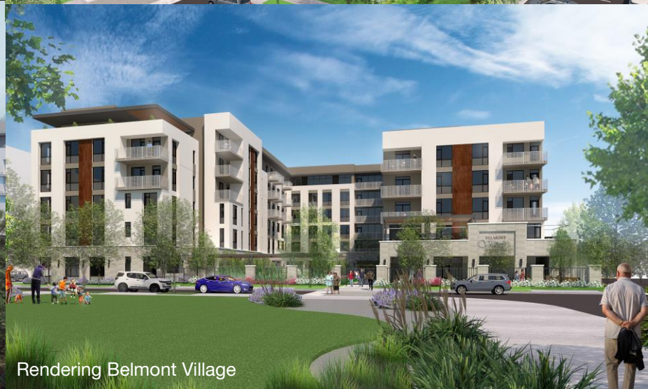
Rendering Belmont Village