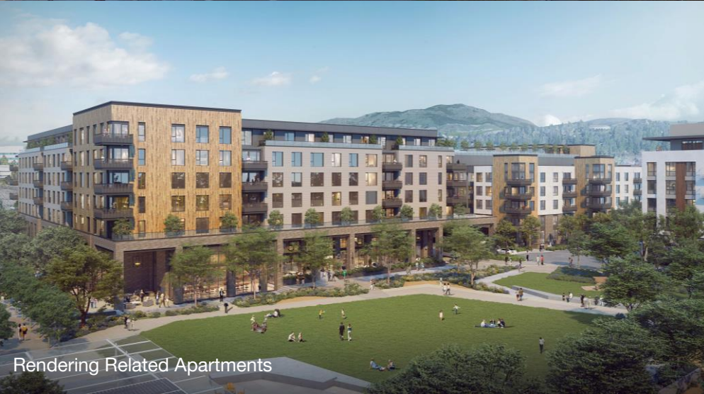
Rendering Related Apartments