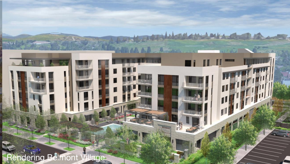
Rendering Belmont Village